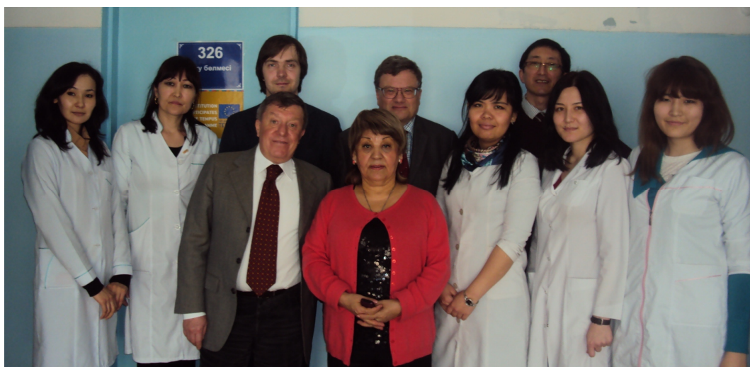
Picture: The Environmental and Health Centre created by the project in Almaty (Kazakhstan)